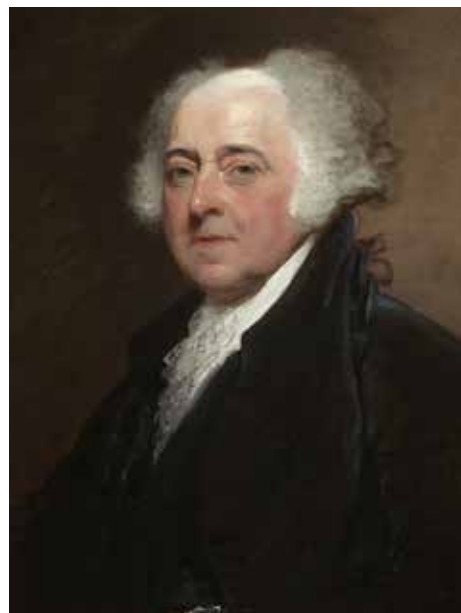
John Adams, 2nd U.S. President.