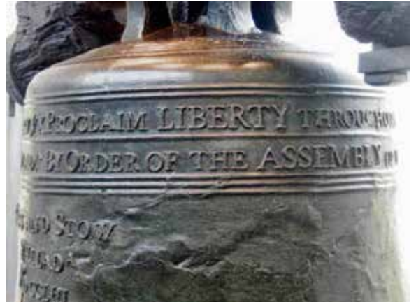
Proclaim liberty throughout the land" – Inscription on the Liberty Bell.

Patriotic speeches and publications during the period of the struggle for independence were often infused with Biblical motifs and quotations. Even the basic framework of America clearly reflects the influence of the Bible and power of Jewish ideas in shaping the political development of America. Nowhere is this more evident than in the opening sentences of the Declaration of Independence: