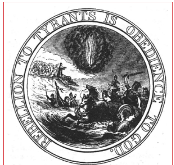
Ben Franklin's proposed design for the Great Seal of the United States included Moses parting the Red Sea.

The first design for the official seal of the United States recommended by Benjamin Franklin, John Adams and Thomas in 1776 depicts the Jews crossing the Red Sea. The motto around the seal read: "Resistance to Tyrants is Obedience to God."