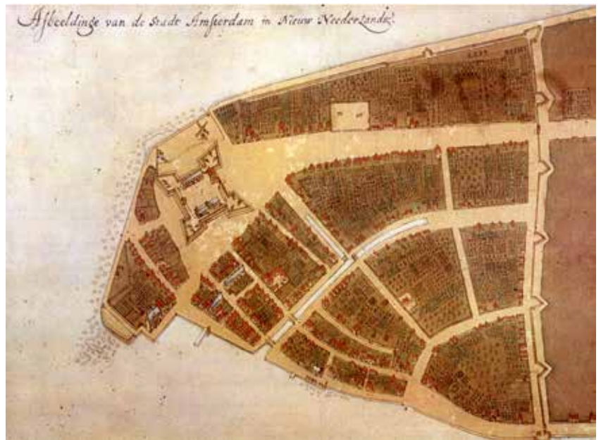
A 1660 map of New Amsterdam.

In fact, so many Jewish conversos came to Mexico that the Spanish made a rule precluding anyone who could not prove Catholic ancestry for four generations back from migrating there. Needless to say, the Inquisition soon followed to make sure these Jewish conversos were not really heretics, and burnings at the stake became a regular feature of life in Mexico City.